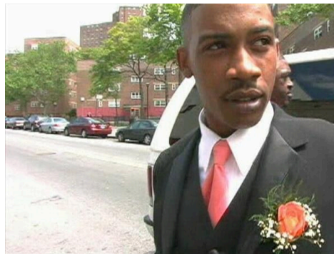
AFTER MUMMY 80'S RAP

SACRILEGIOUS DENIAL TO LIVE "BY GRACE OF GOD"